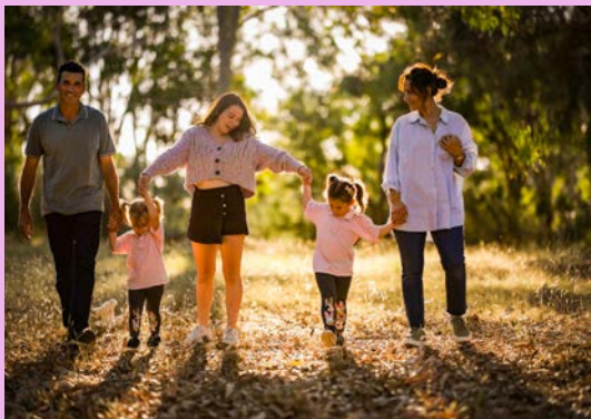
Family Photos with Digital Journey