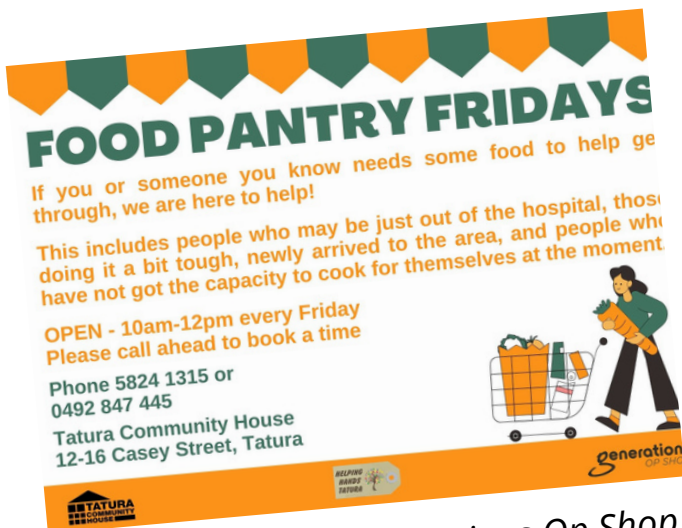
Food Pantry with Generations Op Shop