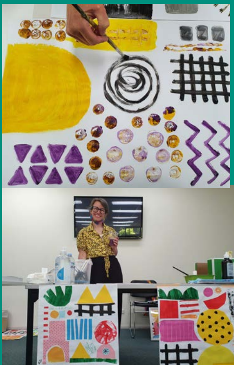
Art Work Shops - November 2021