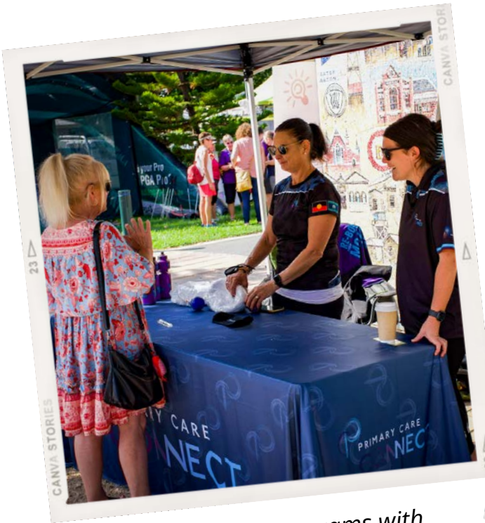
Exercise Programs with Primary Care Connect