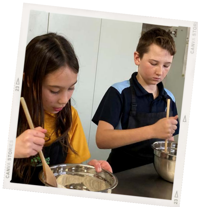
Letters and numbers in practice!