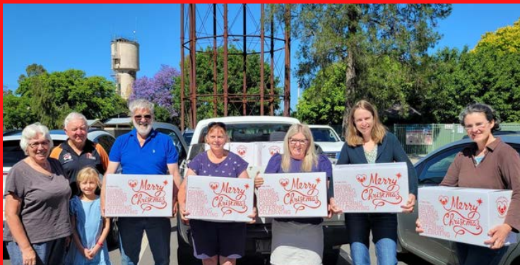
Reverse Advent Calendar- December 2021