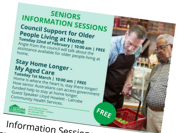
Information Sessions with Greater Shepparton City Council and LaTrobe Community Health Service