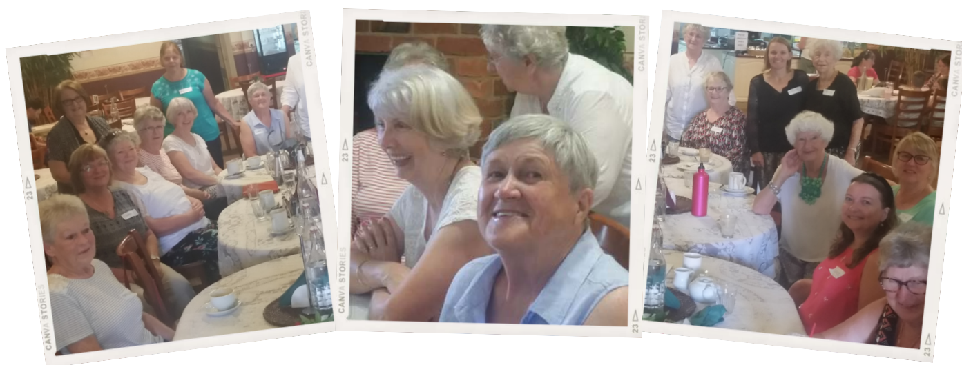
The friendly Tat Gathering Group in action.