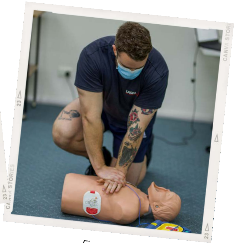
First Aid with Stitches First Aid Education