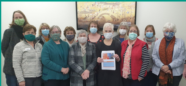
Diversity Training - July 2021